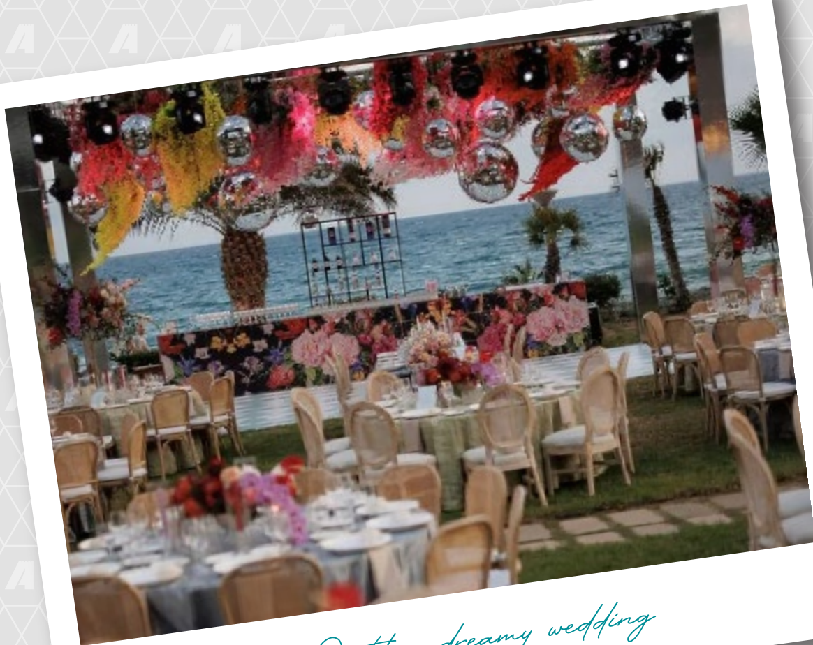
Outdoor dreamy wedding