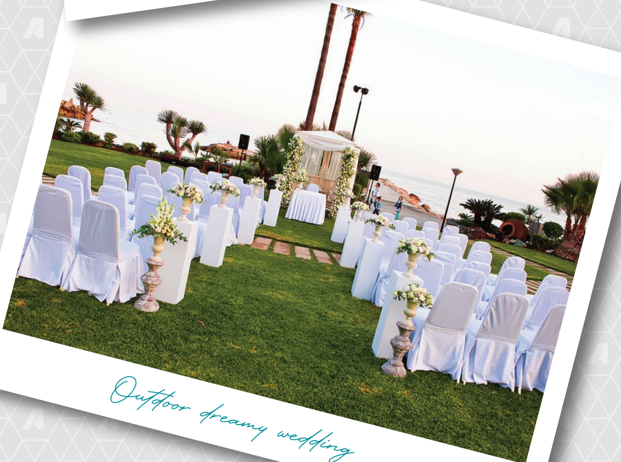
Outdoor dreamy wedding