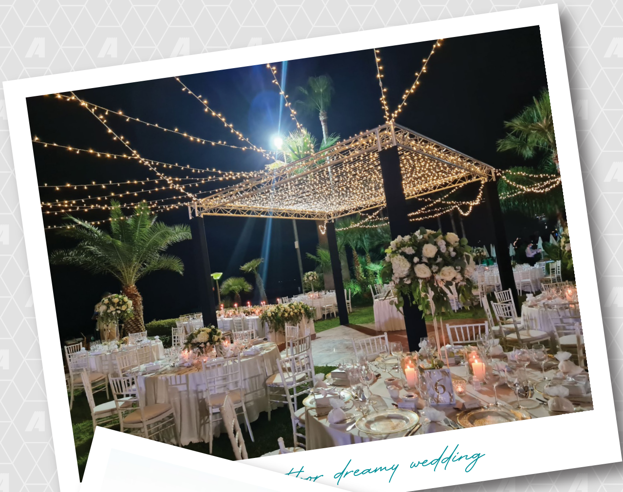
Hot dreamy wedding