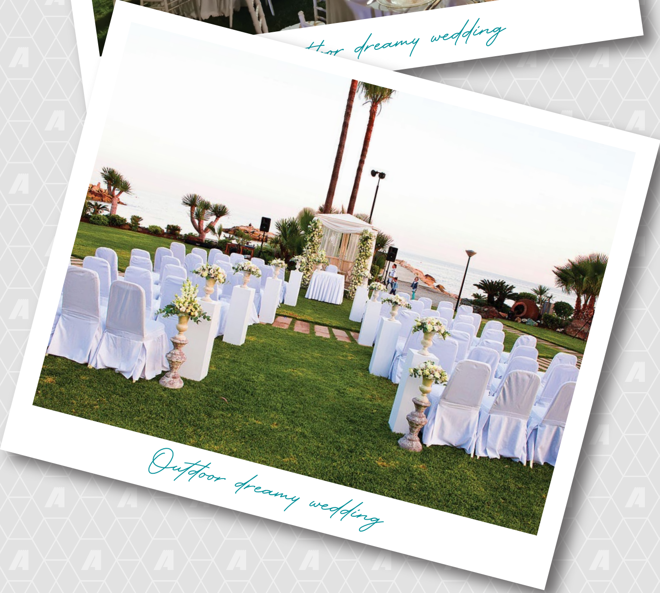
Outdoor dreamy wedding