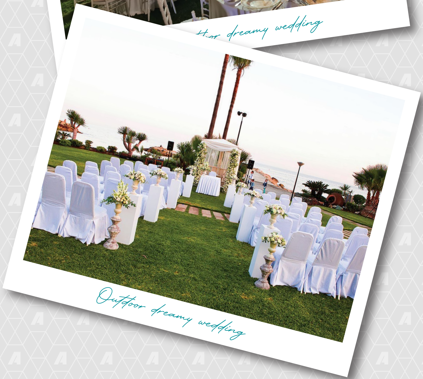
Outdoor dreamy wedding